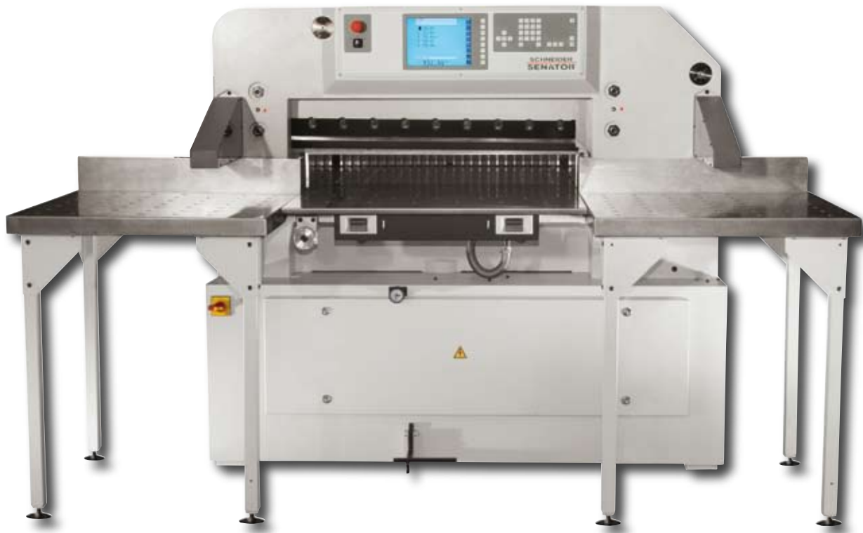
The illustration shows the machine including airfilm side-tables LST 750 with stainless steel surface, rustproof.